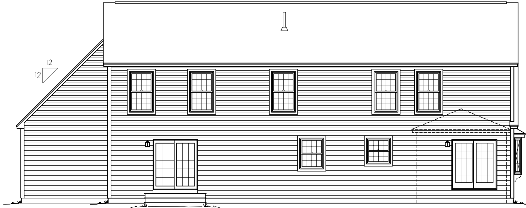
E-1 REAR ELEVATION SCALE: 1/8" = 1'-0"