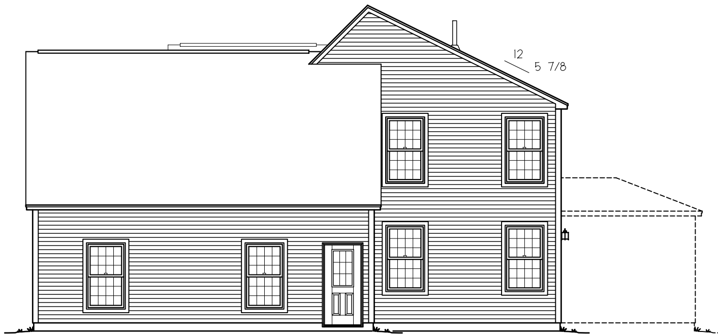
E-2 RIGHT ELEVATION SCALE: 1/8" = 1'-0"