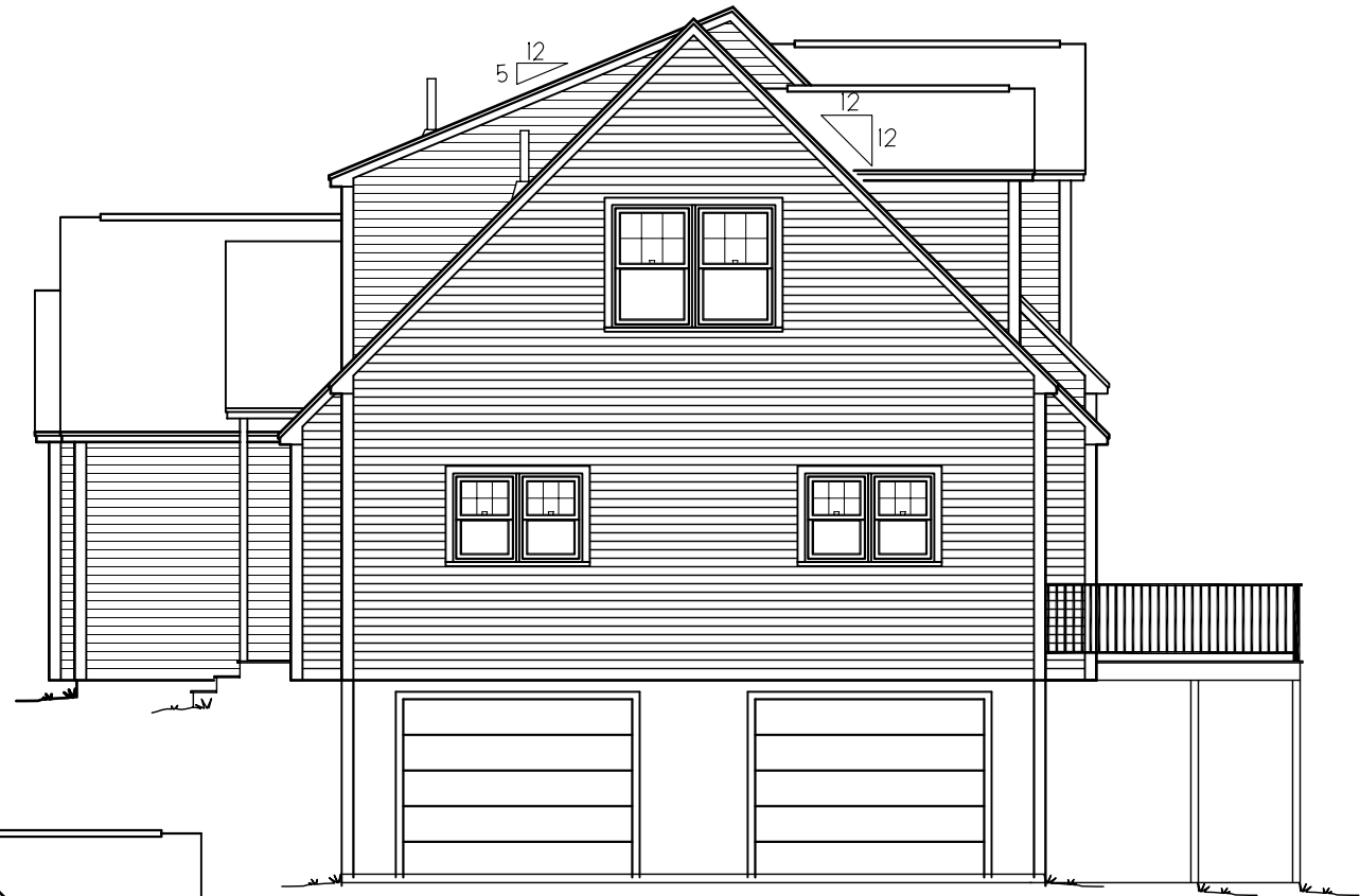
E-1 RIGHT ELEVATION SCALE: 1/8" = 1'-0"