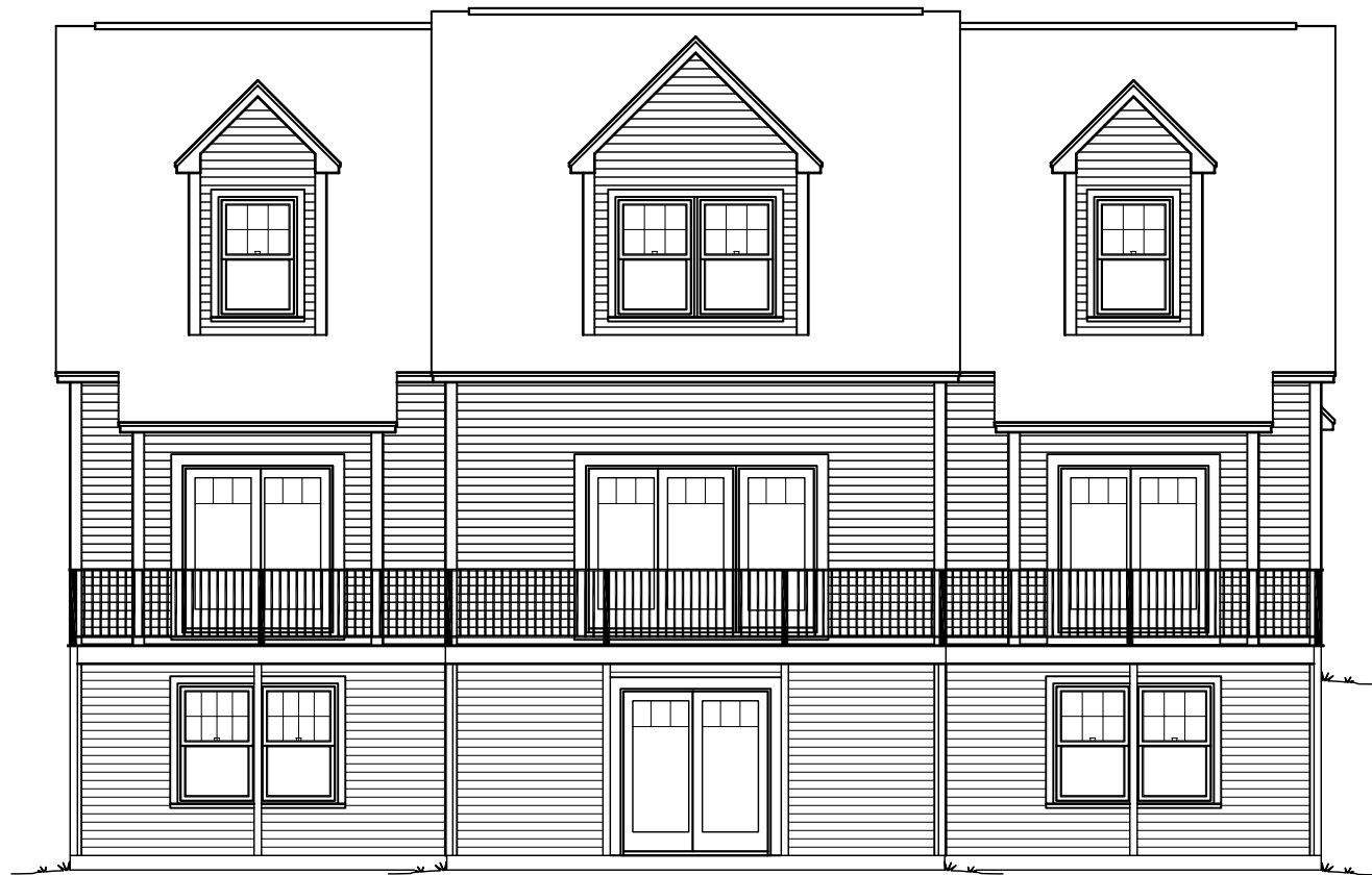
E-2 REAR ELEVATION SCALE: 1/8" = 1'-0"