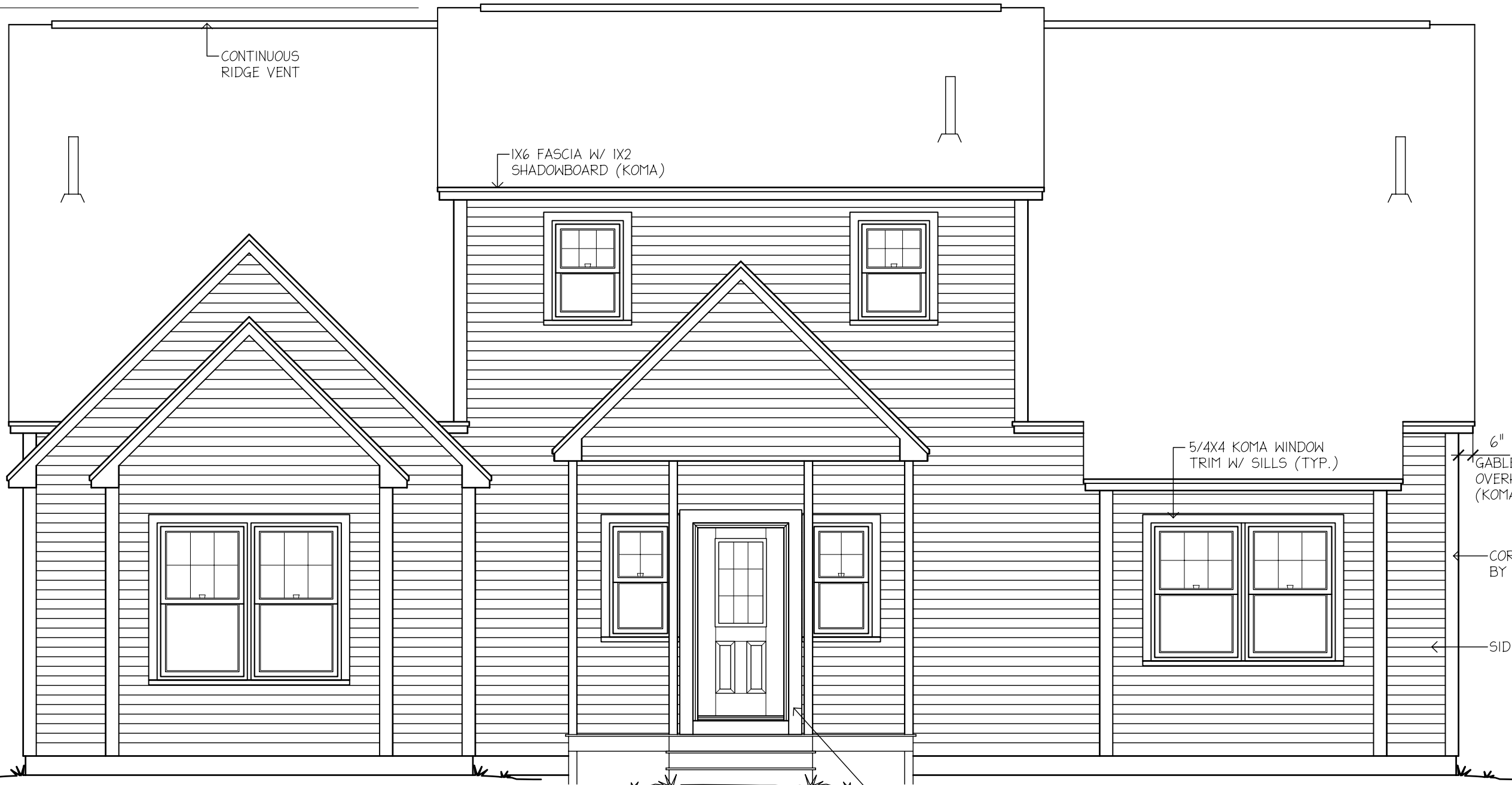
E-1 FRONT ELEVATION SCALE: 1/4" = 1'-0"